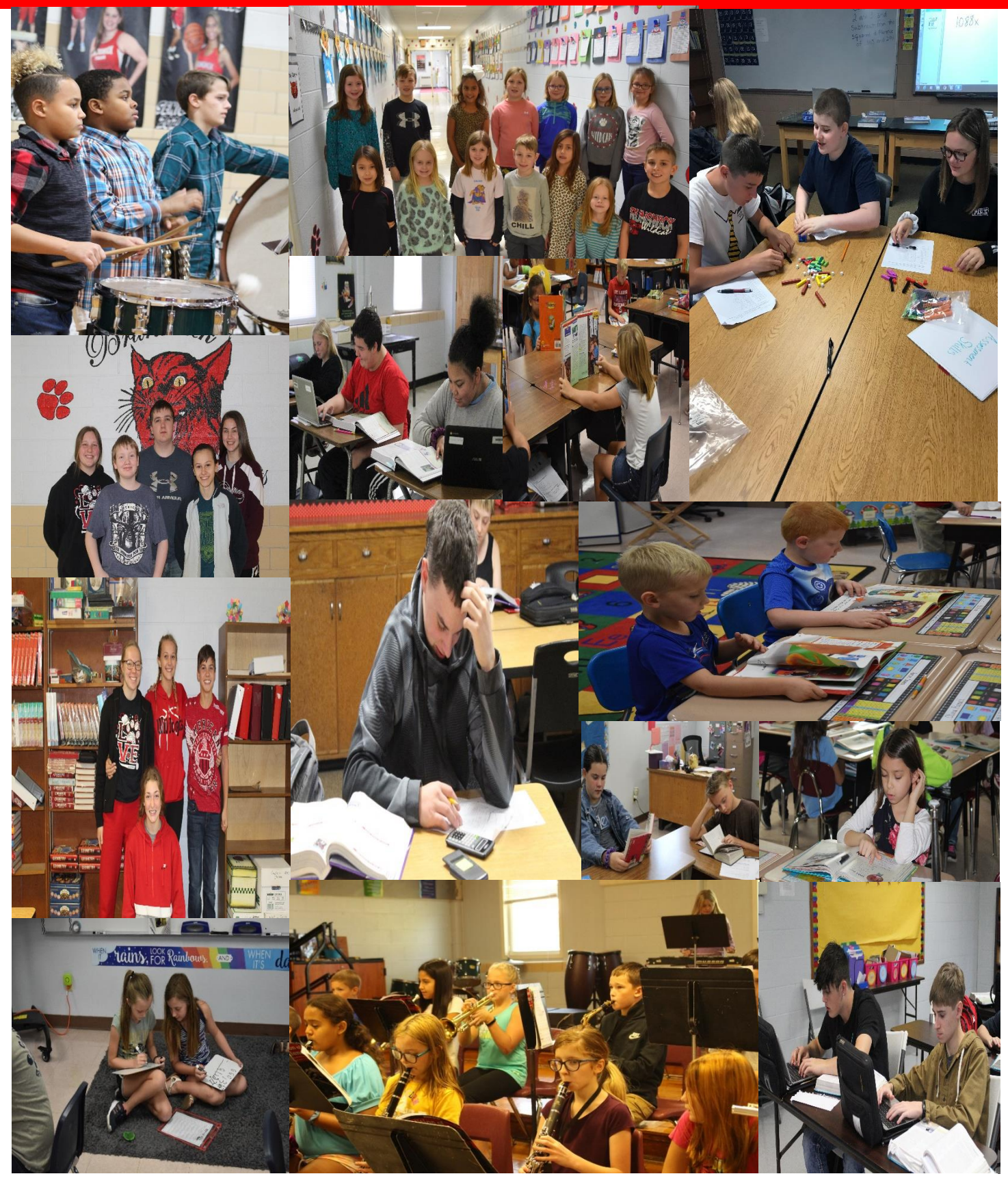
Safe Return to In-Person Instruction and Continuity of Services Plan